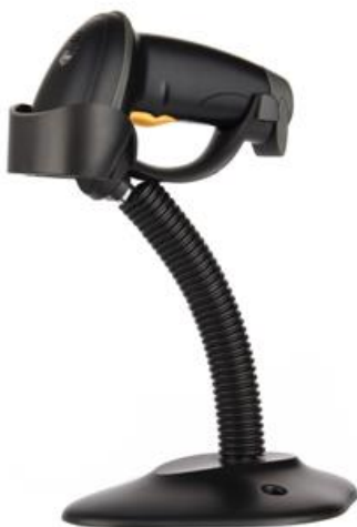
Stand render figure

In order to facilitate transportation, the stand delivery in the form of parts.